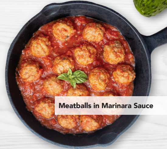
Meatballs in Marinara Sauce